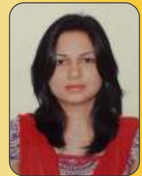
Ekta Vishnoi Joint Commissioner, Income Tax Office