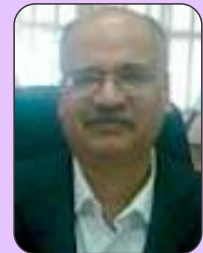
Chandrashekhar Oak Collector & District Magistrate Mumbai City